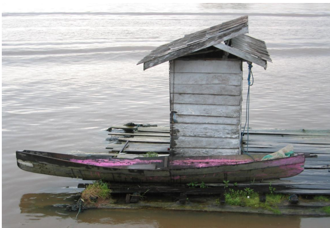
Figure 2: A floating latrine in an urban flooded city of Borneo: A coping mechanism with poor public health implications