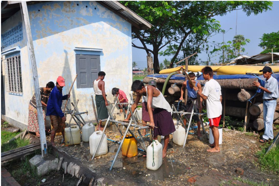
Figure 1: A standpipe installation supplying about 1000 inhabitants